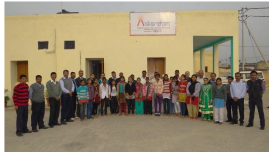
Panchayat Representatives, Group CSR Committee and a group of learners