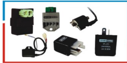
CDI/RR/Ignition Coils/Igniters/Relays & Flashers